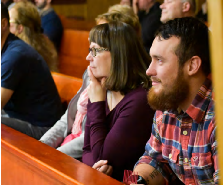
In 2020, the annual youth conference, Steubenville Atlantic was unable to happen because of COVID restrictions but in preparation for the event were two Nights of Worship. In place of the conference itself, youth gathered in their parishes to participate in the virtual conference in Florida.