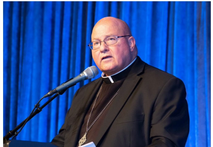
Archbishop Dunn speaking at the Archbishops Dinner in 2019. Funds raised from the Dinner went to support infirmed and Retired Priests which cost over $428,000 in 2019.