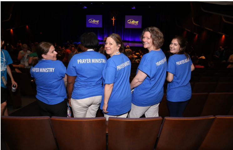
Steubenville Atlantic 2019 Prayer Ministry volunteers. This annual youth conference is organized and funded by the Archdiocese. 494 people from 7 diocese participated in this conference in 2019.