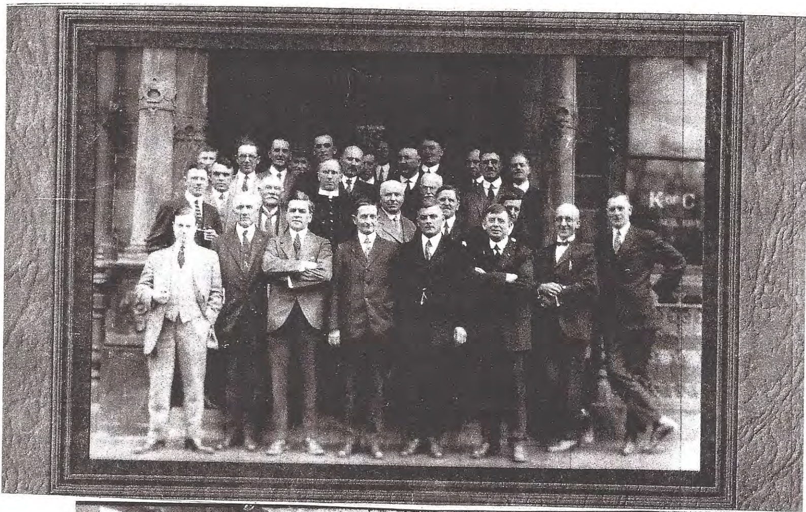
[ca. Year 1923] HALIFAX COUNCIL 1097, KNIGHTS OF COLUMBUS, Officers and Members in front of Keith (Columbus) Hall, 65 Hollis Street Halifax, N.S. (renumbered now as 1475 Hollis).