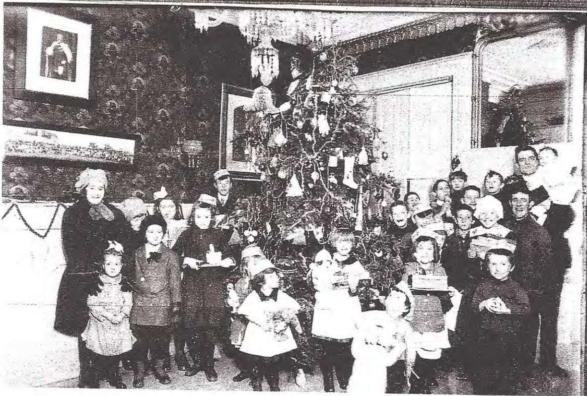
Halifax Explosion (1917) Children Shelter by K of C Keith Hall