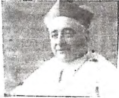
Archbp. E.J. McCarthy

The aftermath of the Explosion called for taking care of survivors, identifying and burying the dead, reconstruction of buildings and houses, etc. Among the key players of that time were a number of men who were also members of the Halifax Council 1097, Knights of Columbus . Archbishop McCarthy , himself a charter member, immediately calls upon Ottawa to offer substantial assistance, while the following are illustrative of acts by other members: